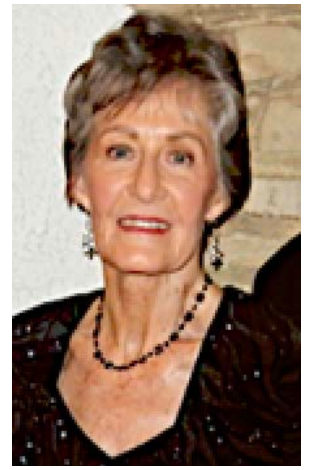
CJC New Year's Eve Gala: Garden Chalet Banquets