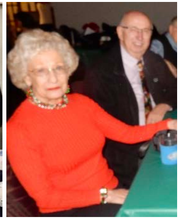
CJC Holiday Party