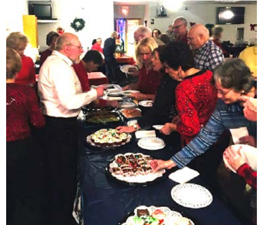
Saturday, December 14, 2019