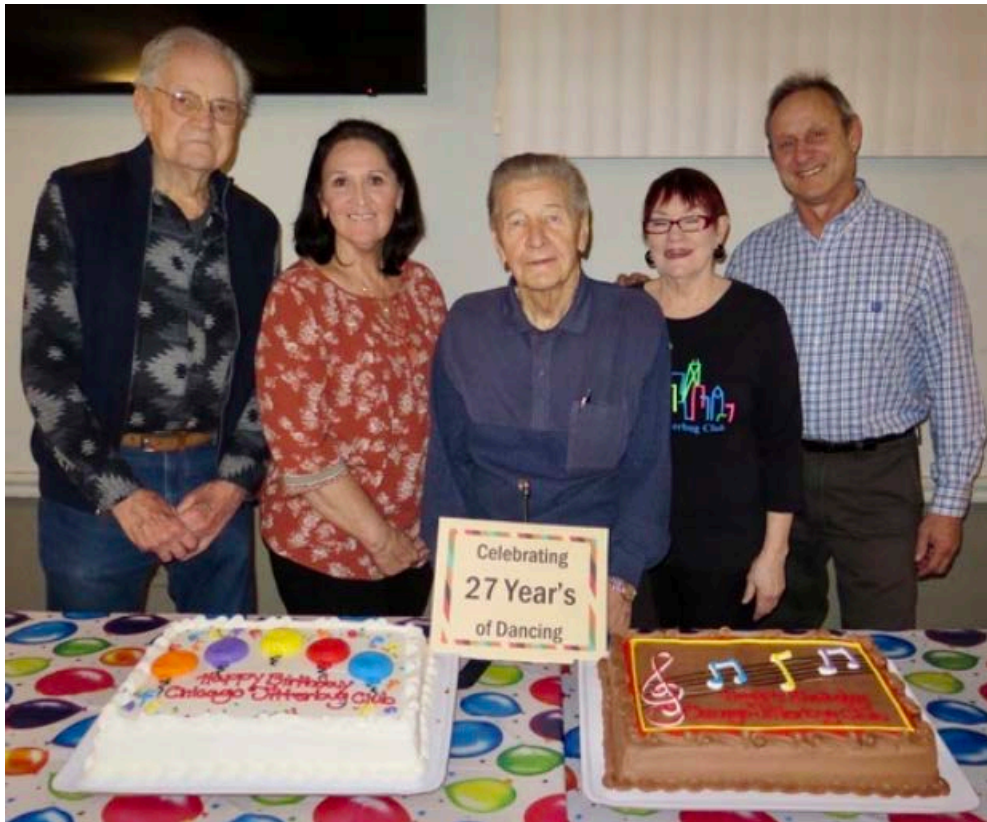
Happy Birthday CJC!